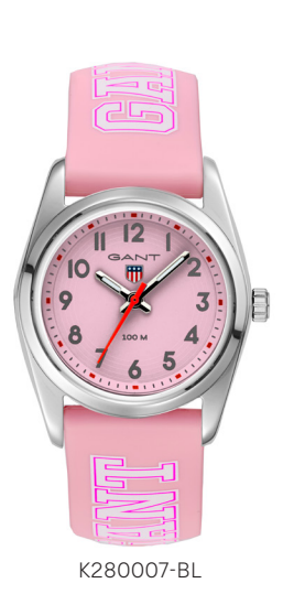
FUNCTIONS: 3 HANDS | CASE DIAMETER: 28 MM | CASE THICKNESS: 8 MM | LUG WIDTH: 16 MM CASE MATERIAL: STAINLESS STEEL | CRYSTAL: SCATCH RESISTANT MINERAL | STRAP MATERIAL: SILICONE MOVEMENT: SEIKO Y121F | BATTERY: SR626SW | WATER RESISTANCE: 10 ATM