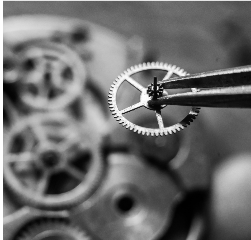
Perfect craftsmanship and precision movements with uncompromising quality and technology standards.